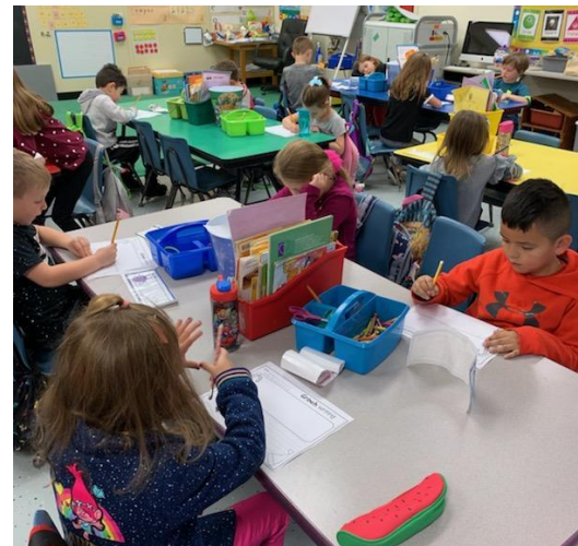
Above: Kindergarten students started narrative writing! The kids have been hard at work practicing mechanics and getting more comfortable writing their OWN stories with pictures and words!

Quote of the Week: "It is one of life's bitterest truths that bedtime so often arrives just when things are getting really interesting."